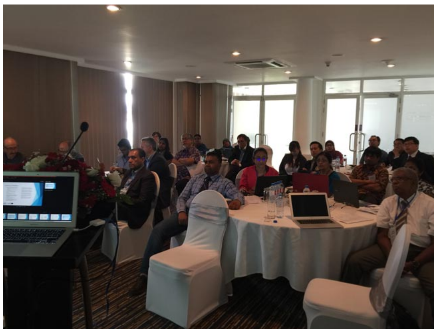
Photo: CABARET launch participants

Kick off meeting also provided a forum to: Publicly state that the project is beginning; Communicate the shared view of the project; and to Establish a commitment by project partners.