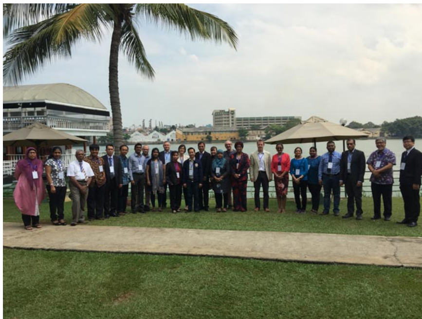
Photo: CABARET launch participants