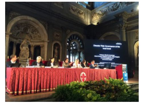
Photo: Prof Amaratunga opened the session with a short presentation on the Implementation of the Sendai Framework at the Local Level within the context of risk governance including some of the very complex and challenging issues of risk governance

Disaster Risk Governance refers to "the way in which public authorities, civil servants, media, private sector and civil society coordinate at the local, national and regional levels in order to manage and reduce disaster - and climate-related risks." Strengthening governance has been identified as essential to reduce disaster risk. There is also the emphasis for the need for strengthening disaster risk governance at the local level for prevention, mitigation, preparedness, response, recovery and rehabilitation. Addressing fundamental issues that underpin risk - including governance, within the context of DRR creates a global platform for addressing risk in a way that ushers it into the mainstream of daily political and civil life. Stakeholder participation, collaboration, flexibility, learning, accountability and transparency—are indicative of good governance, and are enablers of long-term DRR and adaptation.