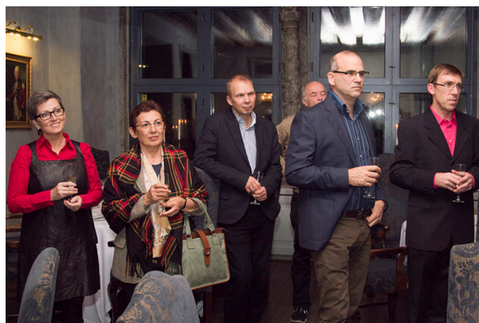
ABOVE: The annual ANDROID network conference was held in Tallinn, Estonia and the first opportunity for all partners to meet and discuss the network's ambitious workplan