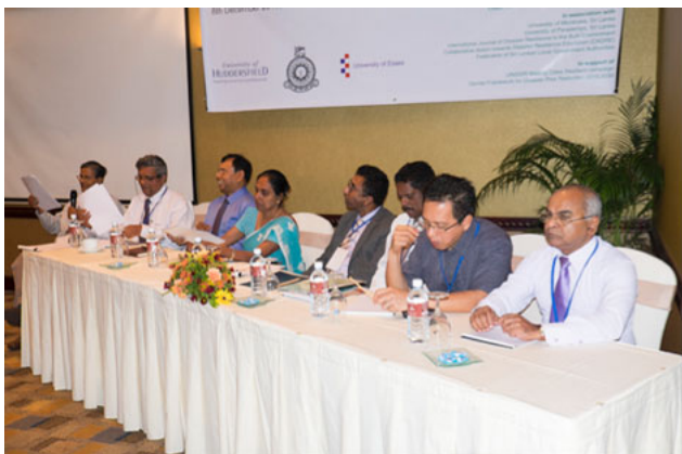
Photo: panel discussion